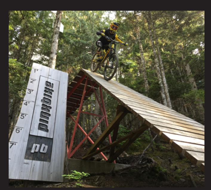
Lorant dropping into Clown Shoes, Whistler

Ladies Legion has been a subset of 529 Legion for years. This year we have increased our rides with younger women, older women and some new friends who had never mountain biked before! We host an encouraging women-only ride once a month that always encompasses progression and ends in hugs and smiles.