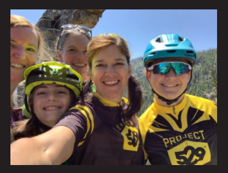
Ladies Legion and Youth Legion

The 529 Legion Youth Program guided eight middle and high school kids into participating in their first community cross country mountain bike races. Coaching in the WA Student Cycling League (WSCL) put us into contact with kids from families that were not aware of the opportunities in our area. Their parents didn't know how to get their enthusiastic riders into a competitive format in the area. We provided information and support to get the kids racing in a local series, and most of them had a chance to stand on the podium at least once!