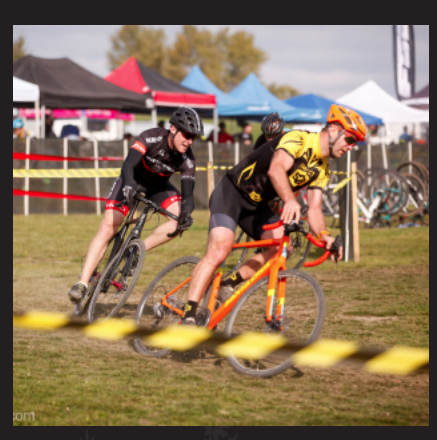
Craig advancing positions in CX race, Washington

529 Legion riders also raced at Whistler Crankworks, Race Cascadia, Leadville, the Swiss Alps Epic, local and national cyclocross events, NW Epic Series, local enduros and NWCup Races.