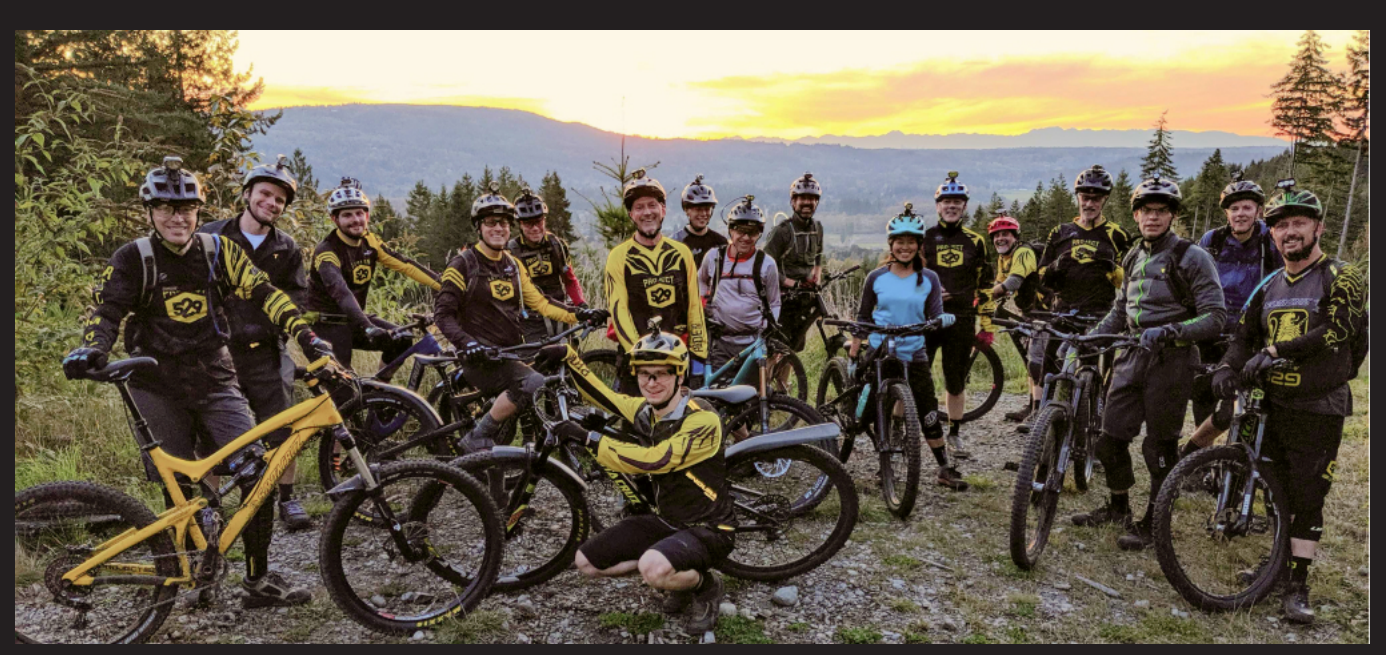
Riders at Thursday Night Ride work 9 to 5, but live 5 to 9

Our Thursday Night Rides have been officially providing an open invitation to ride local area trails with a bunch of 529 Legion riders for 16 years. We start the ride at 6:00 pm. We end the evening with dinner. Some nights we have five riders but other nights the group is as large as 25 riders forming a couple of smaller groups. It is a great opportunity for everyone on 529 Legion to introduce friends to the sport, meet new riding buddies and always know we've got a chance to ride before the weekend.