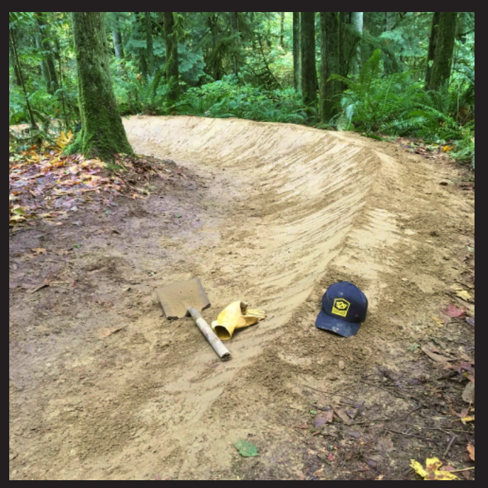
529 member donating time to improve trails for the community