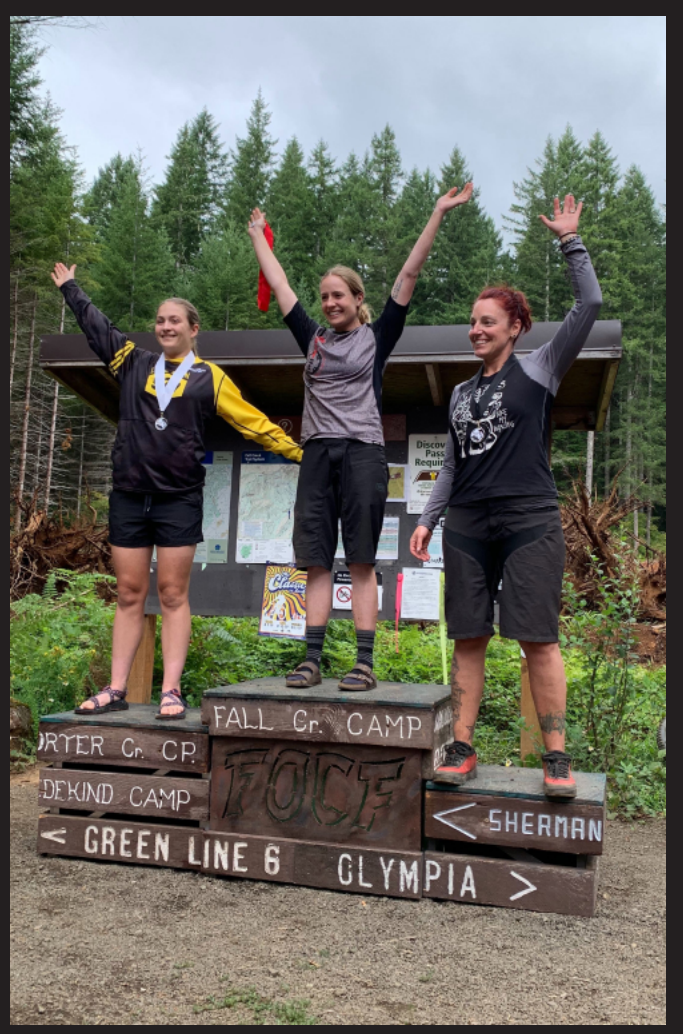
When she wins, we all win